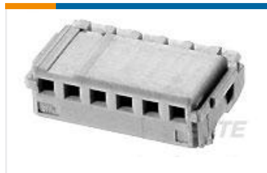
TE Part #1-353908-3 CT REC HSG 13P CRIMP TYPE WHIT