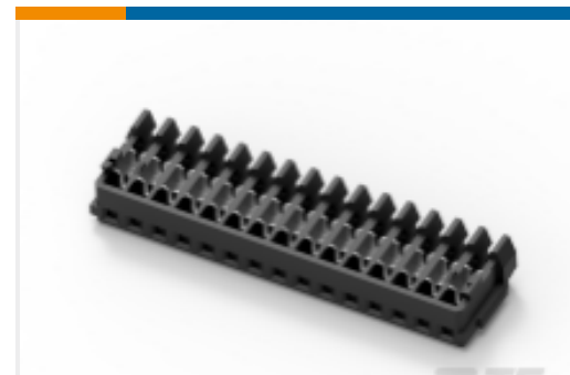
TE Part #3-353293-5 1.5MM CT MT REC ASSY 15P BLACK