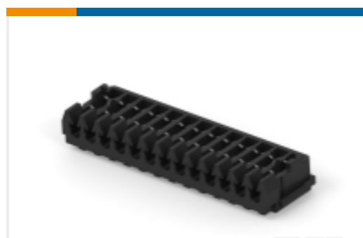
TE Part #3-353293-3 1.5MM CT MT REC ASSY 13P BLACK