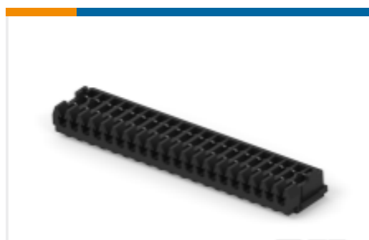
TE Part #4-353293-0 1.5MM CT MT REC ASSY 20P BLACK