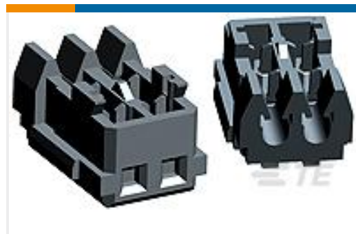
TE Part #1-353293-3 MINI CT MT REC ASSY 13P GRAY