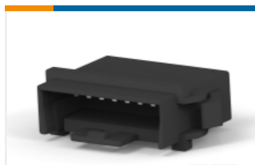
TE Part #2-292215-8 MINI CT SGL RELAY 8P BLACK