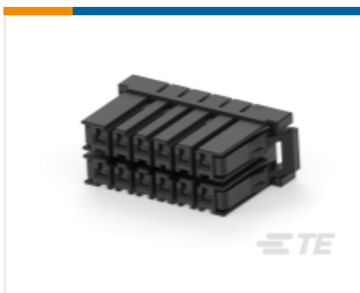
TE Part #1-179555-8 Receptacle and Tab Housing: 5.08 mm pitch, 250-600V