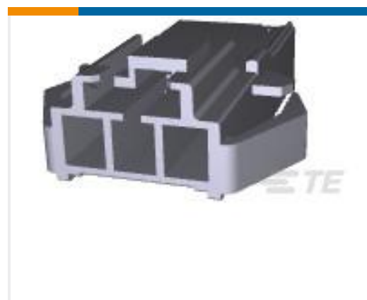
TE Part #176293-1 UNIV POWER CAP HSG 3P P/MOUNT