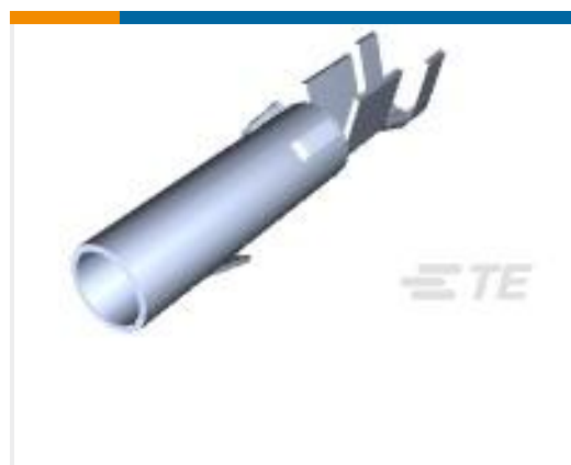
TE Part #170148-1 MATE-N-LOK SOC LP