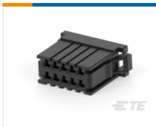
TE Part #1-178802-8 Receptacle and Tab Housing: 3.81 mm pitch, 250V