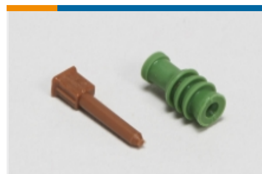
Automotive Seals &amp; Cavity Plugs(5)