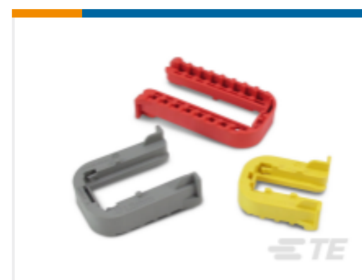
TE Part #1703838-6 Heavy Duty Sealed Connector Series Fixing Slides