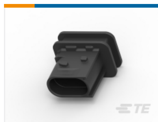
TE Part #2112299-1 PROTECTION CAP, FOR REC.HSG GR