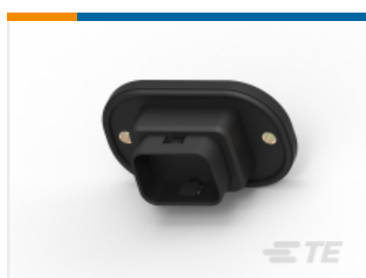
TE Part #1823444-1 ADAPTER,FOR A-PILLAR,ASSY