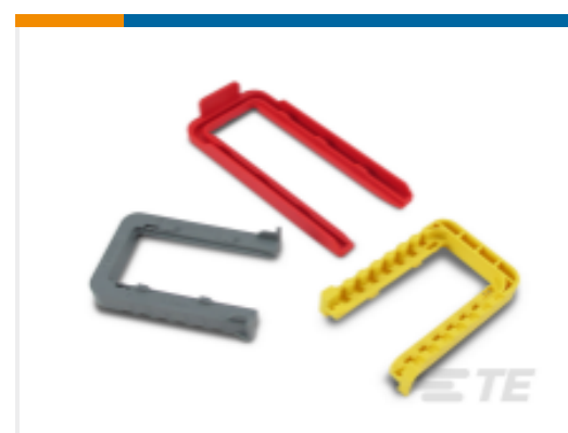
TE Part #2112166-3 LEAVYSEAL LOCKING SLIDES