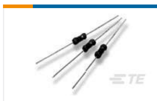
TE Part #5-1625885-2 1W SM M/OX 5% 27R