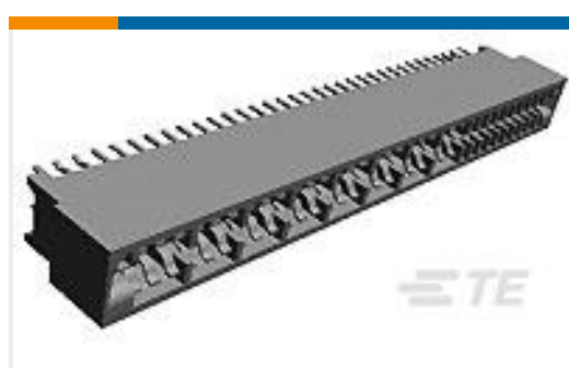
TE Part #1761426-1 CONNECTOR ASSY, ULTRA HIGH CURRENT CARD