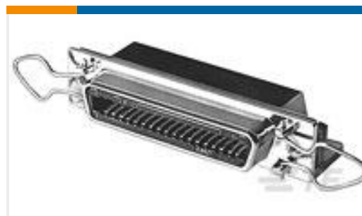
TE Part #1734044-1 Centronics,RCPT 36P,R/A,PB