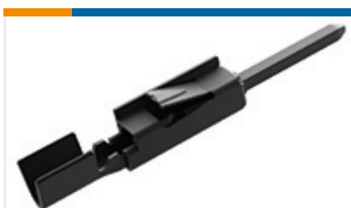
TE Part #1740335-7 MQS PIN CONTACT