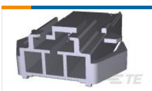
TE Part #176293-2 UNIV POWER CAP HSG 3P P/MOUNT