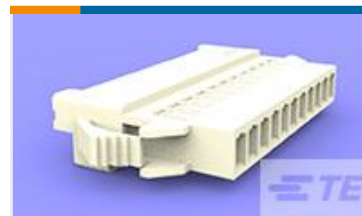
TE Part #1969590-3 HSG, REC, PANEL MOUNT, SINGLE ROW,EP2.5