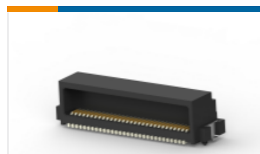
TE Part #1747025-5 ON TAPING(EMBOSS) 0.5MM PITCH