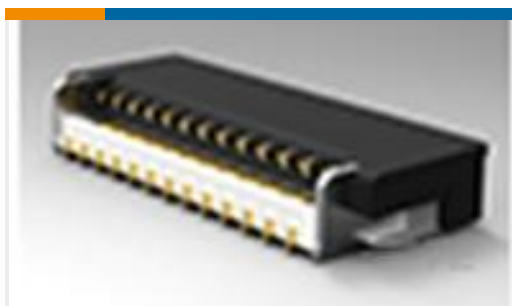
TE Part #2-2040832-1 EMBOSS TAPING 0.25FPC BF-L-1.3