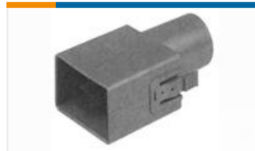
TE Part #1103018-1 MDL2.3+4.STI.C