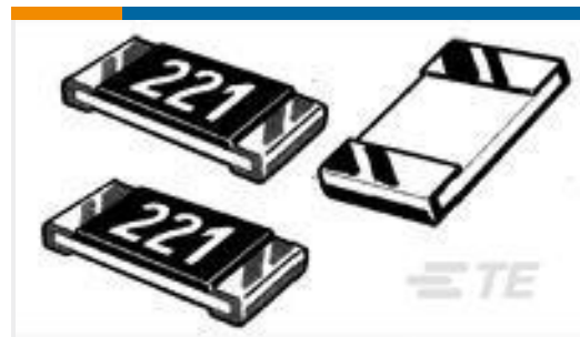
TE Part #2-2176231-2 3522 75R 1% 3W