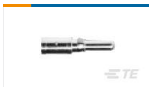
TE Part #4-1105250-1 HSM-C-Sti.Ag.4 qmm