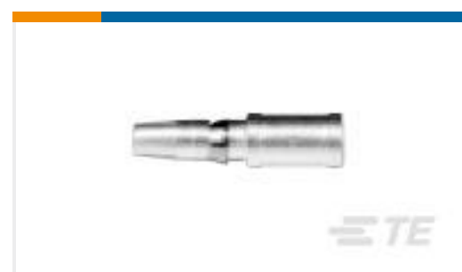
TE Part #4-1105251-1 HSM-C-Bu.Ag.4 qmm