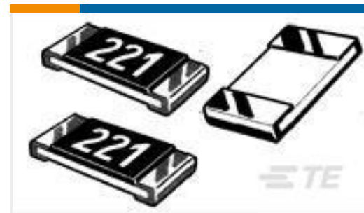
TE Part #3-2176230-2 3522 330R 5% 3W