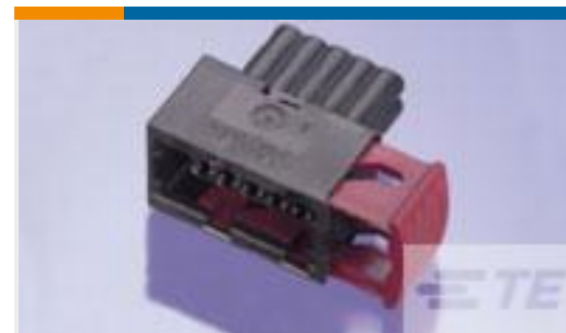
TE Part #1-968879-1 MT2/JPT70P BUGH KPL