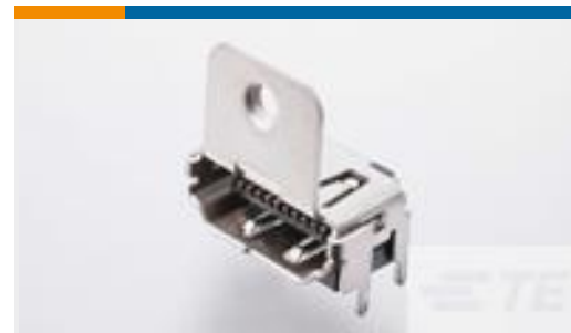
TE Part #2013978-2 Mini HDMI, RA, SMT