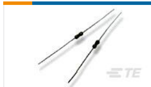
TE Part #1623708-1 RGP0207CH 5% 100M