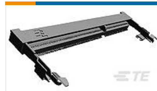
TE Part #2013310-1 SEMI-HARD TRAY DDR3 204P 9.2H