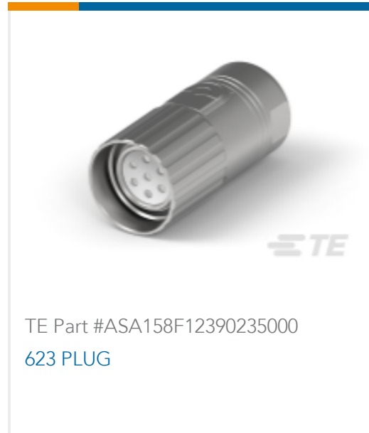
TE Part #ASA158F12390235000 623 PLUG