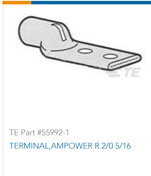
TE Part #55992-1 TERMINAL,AMPOWER R 2/0 5/16