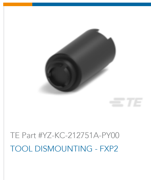
TE Part #YZ-KC-212751A-PY00 TOOL DISMOUNTING - FXP2