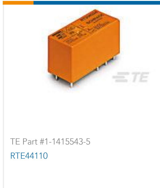
TE Part #1-1415543-5 RTE44110