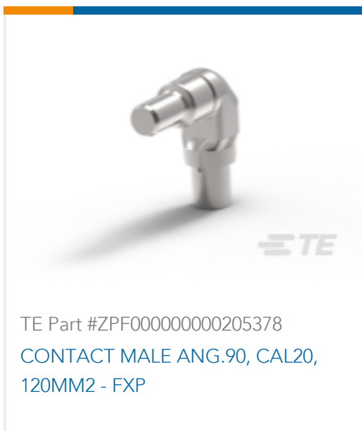
TE Part #ZPF000000000205378 CONTACT MALE ANG.90, CAL20, 120MM2 - FXP