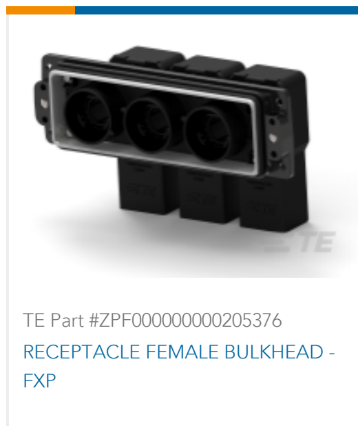
TE Part #ZPF000000000205376 RECEPTACLE FEMALE BULKHEAD - FXP