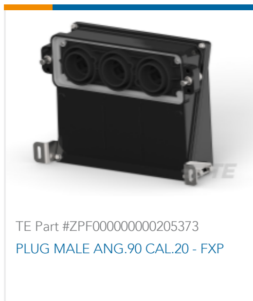
TE Part #ZPF000000000205373 PLUG MALE ANG.90 CAL.20 - FXP