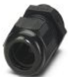
Cable gland, cable gland material: PA, external cable diameter 11 mm ... 17 mm, shielding: no, connecting thread: M25 x 1.5, color: jet black RAL 9005

Cable gland - G-INS-M25-M68N-PNES-BK - 1411134