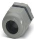
Cable gland, cable gland material: PA, external cable diameter 11 mm ... 17 mm, shielding: no, connecting thread: M25 x 1.5, color: silver-gray RAL 7001

Cable gland - G-INS-M25-M68N-PNES-GY - 1411126