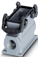
HEAVYCON box mounting base B16, with double locking latch, height 84 mm, with support 1xM25

Please be informed that the data shown in this PDF Document is generated from our Online Catalog. Please find the complete data in the user's documentation. Our General Terms of Use for Downloads are valid ( http://phoenixcontact.com/download )