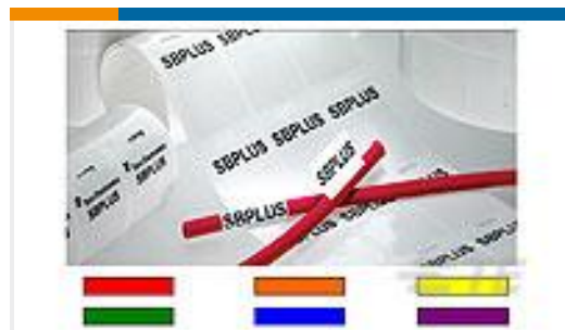
TE Part #CN9926-000 SBP100375WE2.5