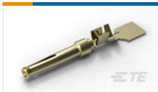
TE Part #166052-1 TD 20 F CRIMP SOCKET WIRE SIZE