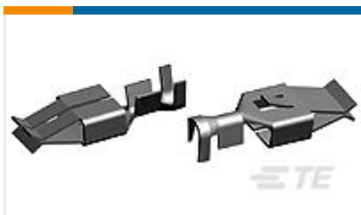
TE Part #926965-1 STC REC 6.3 Contact SRC Sn