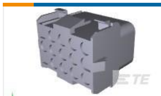
TE Part #926647-3 UNIV.M-N-L.CAP HSG