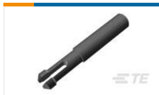
TE Part #1-640415-0 UMNL KEYING PLUG V0