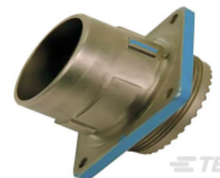
TE Part #YDIV46E11-05PAC009 PLUG ASSY