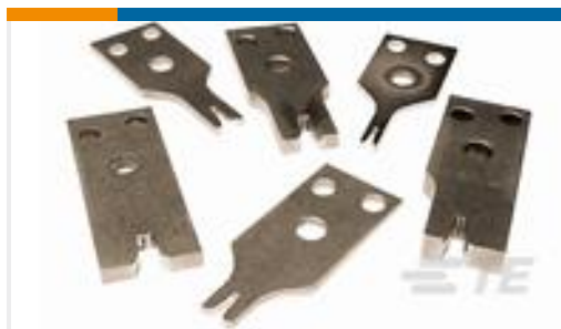
TE Part #808830-1 CRIMPER, SEMI-FLAT