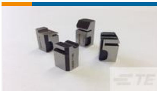
TE Part #462547-1 FLOATING SHEAR