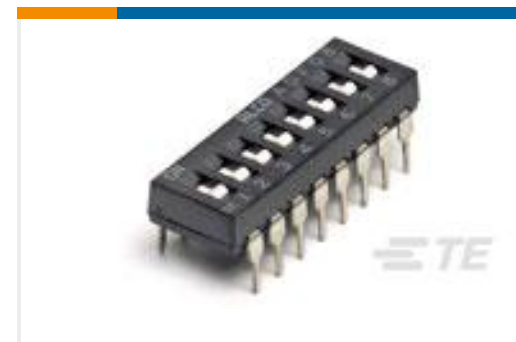
TE Part #3-1825059-7 ADF08S04=DIP SWT,FLUSH,SMT-GW