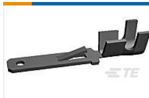
TE Part #42460-1 FF 250 TAB 18-14AWG BR