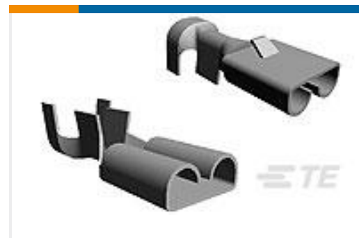
TE Part #6-160448-5 FF 250 REC 1.0-2.5MM2 TPBR