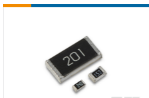
TE Part #4-2176328-6 CRGP 1206 56K 1%