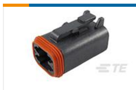
TE Part #DT06-4S-P012 PLG, 4P, BLK, N, SEAL RET