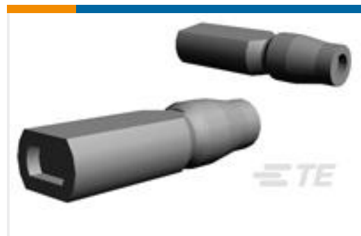
TE Part #1-925017-0 250 FASTON HSG.,REC.,1 POS, NATURAL