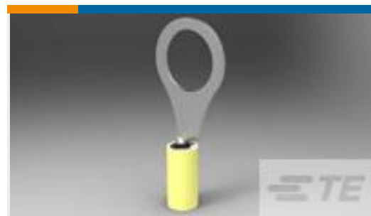
TE Part #35150 TERMINAL, PIDG R 12-10 3/8