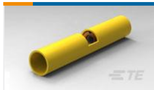
TE Part #327638 SPLICE BUTT PIDG 12-10/16-14