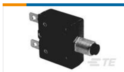
TE Part #1-1423674-0 W54-XB1A4A10-25=CKTBKR, THERM, P ORA