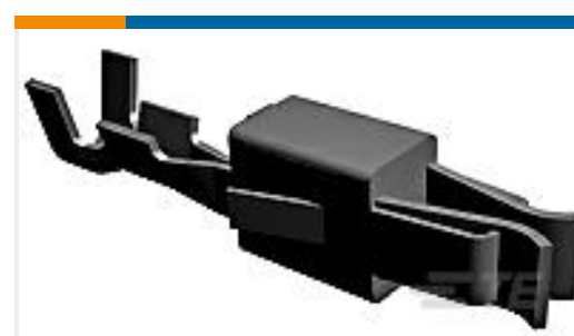
TE Part #927771-3 JPT REC 2.8 Contact SRC Sn