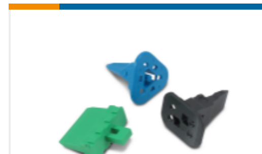
TE Part #W6S DEUTSCH DT WEDGELOCKS