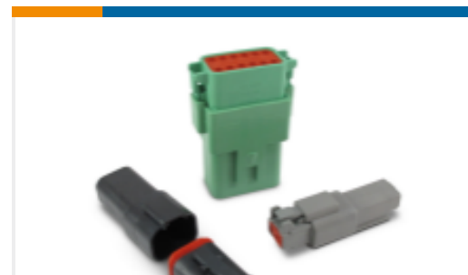
TE Part #DT06-6S DEUTSCH DT Series Housings & Connectors