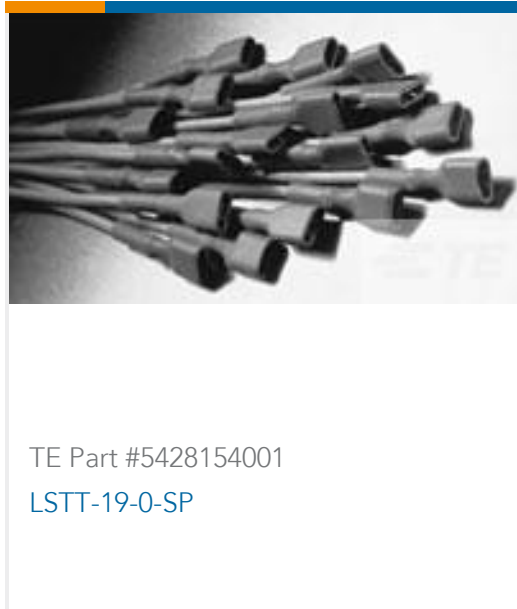
TE Part #5428154001 LSTT-19-0-SP