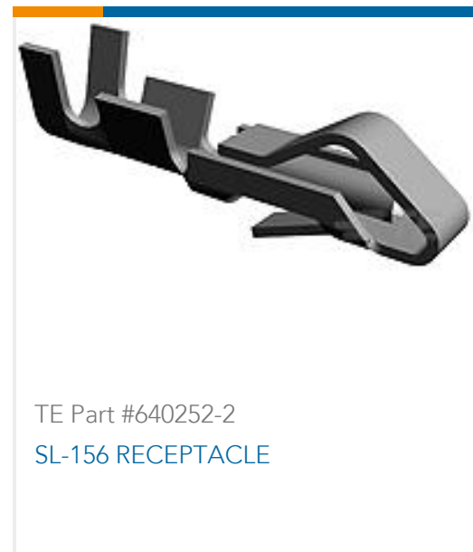
TE Part #640252-2 SL-156 RECEPTACLE