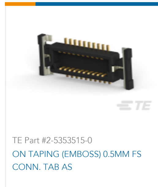
TE Part #2-5353515-0 ON TAPING (EMBOSS) 0.5MM FS CONN. TAB AS