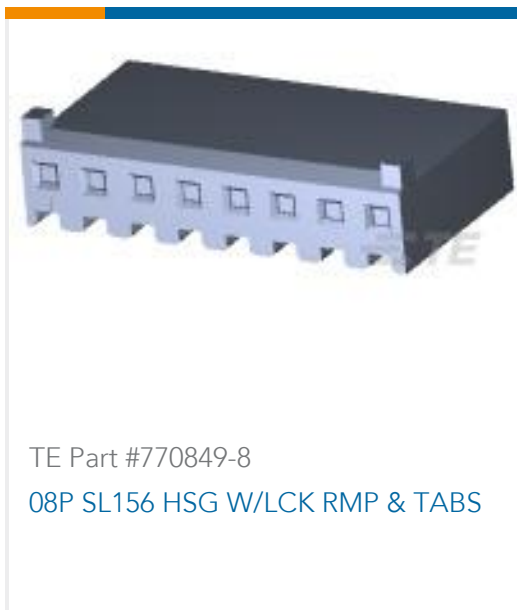
TE Part #770849-8 08P SL156 HSG W/LCK RMP & TABS