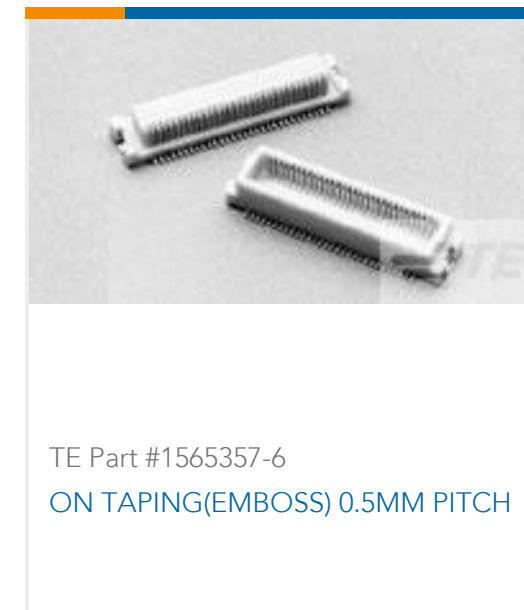
TE Part #1565357-6 ON TAPING(EMBOSS) 0.5MM PITCH