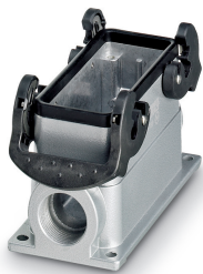
HEAVYCON box mounting base B24, with double locking latch, height 67 mm, with support 1xM25

Please be informed that the data shown in this PDF Document is generated from our Online Catalog. Please find the complete data in the user's documentation. Our General Terms of Use for Downloads are valid ( http://phoenixcontact.com/download )