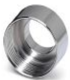
Step-up adapter, M25 to M32, including O-ring

Extension adapter - ENLAR-M-KV-M25/M32 - 1647679