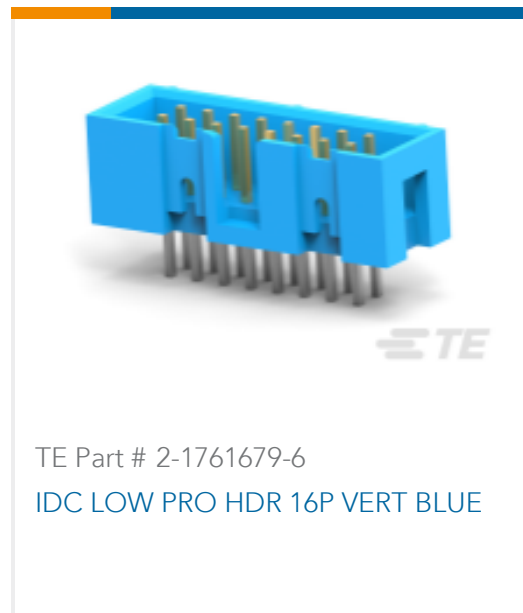
TE Part # 2-1761679-6 IDC LOW PRO HDR 16P VERT BLUE