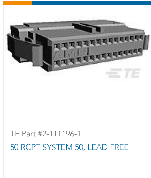
TE Part #2-111196-1 50 RCPT SYSTEM 50, LEAD FREE