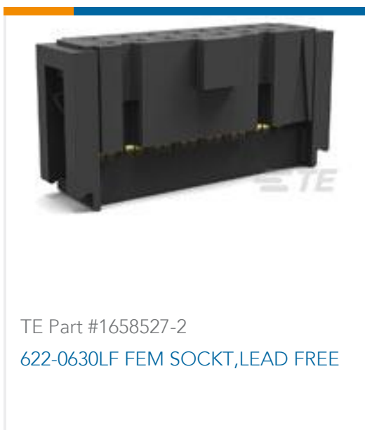
TE Part #1658527-2 622-0630LF FEM SOCKT,LEAD FREE