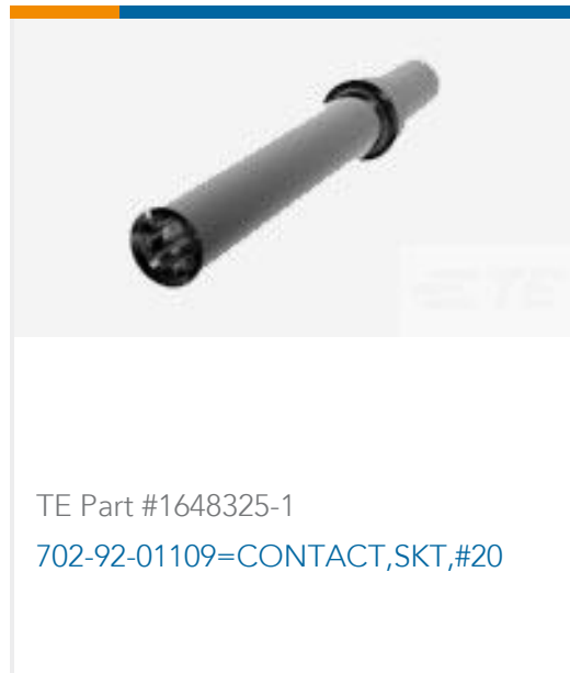
TE Part #1648325-1 702-92-01109=CONTACT,SKT,#20