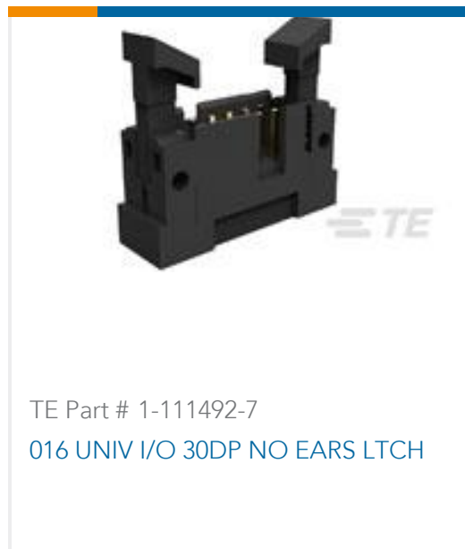
TE Part # 1-111492-7 016 UNIV I/O 30DP NO EARS LTCH