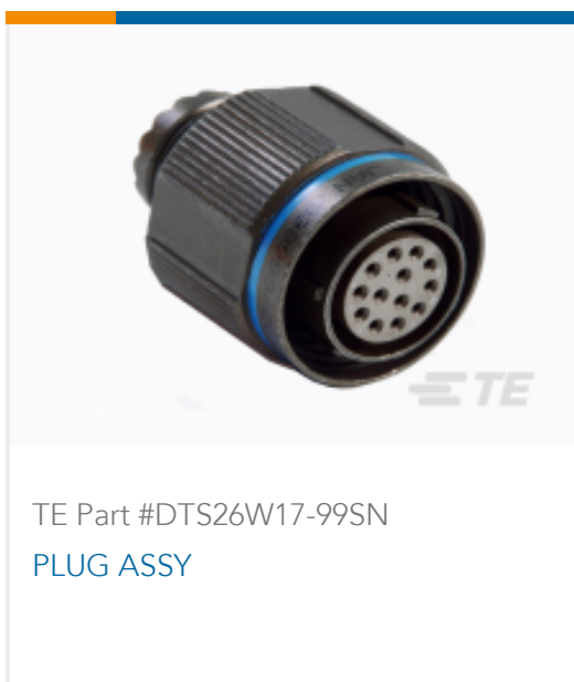
TE Part #DTS26W17-99SN PLUG ASSY