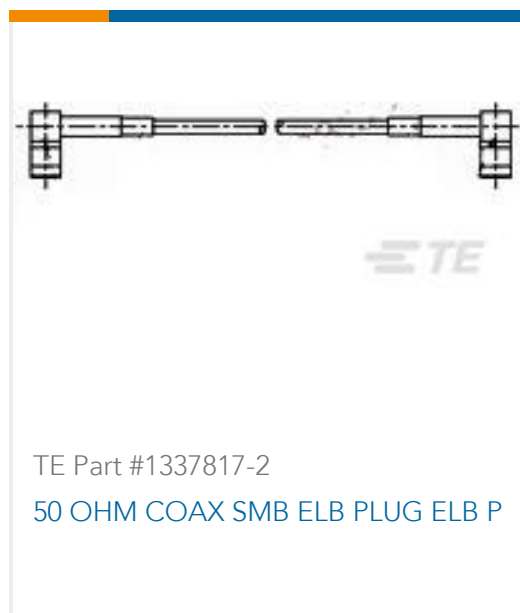
TE Part #1337817-2 50 OHM COAX SMB ELB PLUG ELB P