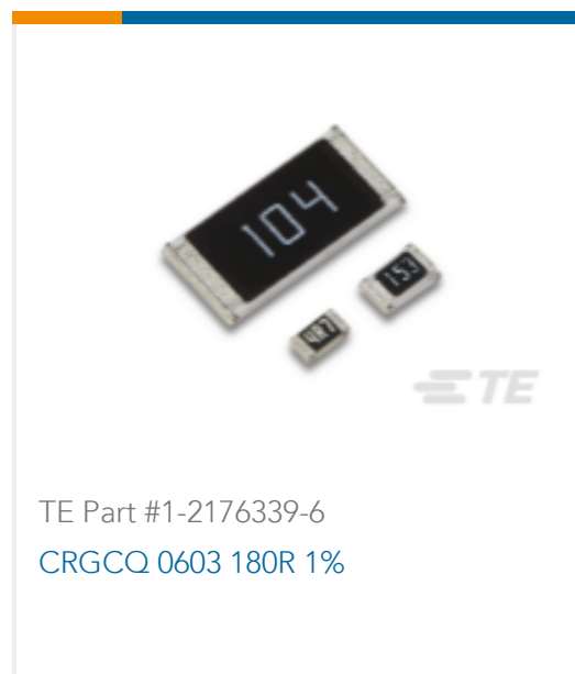
TE Part #1-2176339-6 CRGCQ 0603 180R 1%