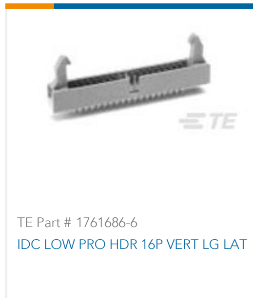
TE Part # 1761686-6 IDC LOW PRO HDR 16P VERT LG LAT