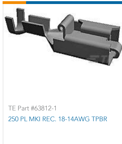
TE Part #63812-1 250 PL MKI REC. 18-14AWG TPBR