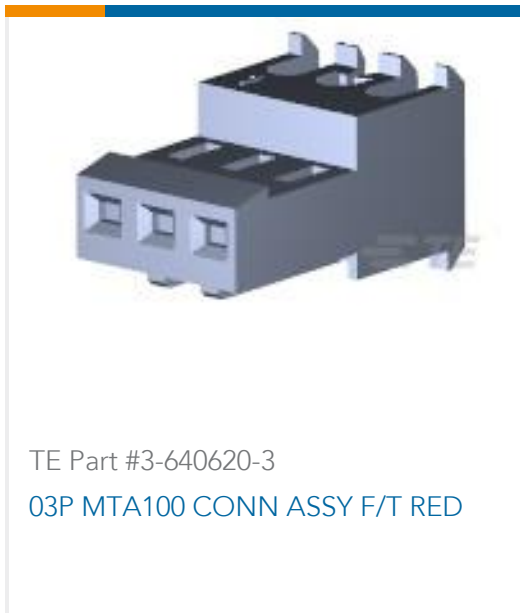
TE Part #3-640620-3 03P MTA100 CONN ASSY F/T RED