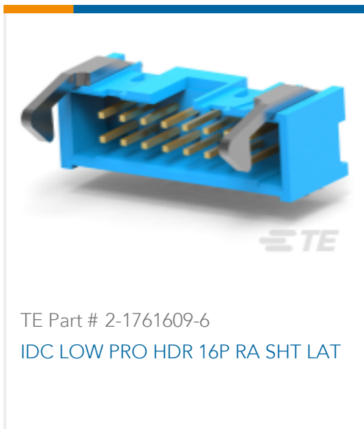
TE Part # 2-1761609-6 IDC LOW PRO HDR 16P RA SHT LAT