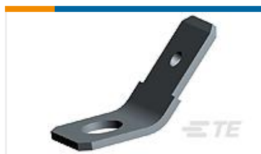
TE Part #140759 250 FASTON,TAB,TPBR