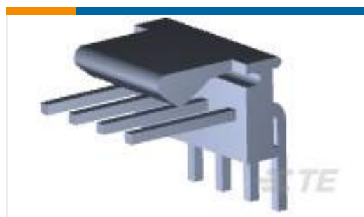
TE Part #3-641127-4 04P MTA100 HDR ASSY FL/RA LF