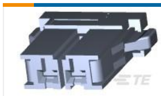
TE Part #1-1747276-2 DYNAMIC D4200 REC HSG 2P/X