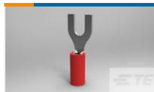
TE Part #130516 PIDG SPADE