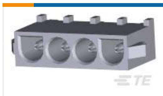
TE Part #770351-1 04P UMNL PIN HDR ASSY W/O DRNS