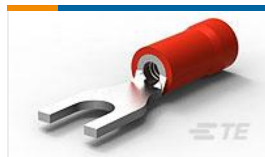
TE Part #171551-1 P.G SPADE