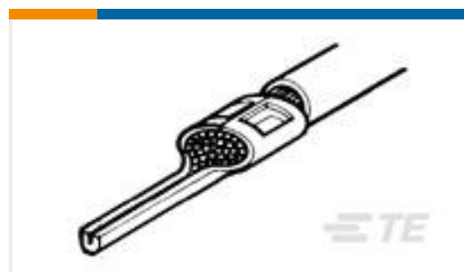
TE Part #180599 SOLIS 8 WIRE PIN