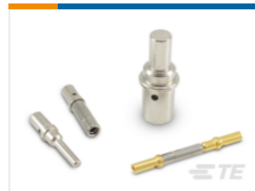
TE Part #0460-202-16141 DEUTSCH SOLID CONTACTS