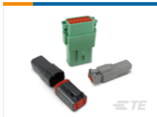
TE Part #DT06-2S DEUTSCH DT Series Housings & Connectors