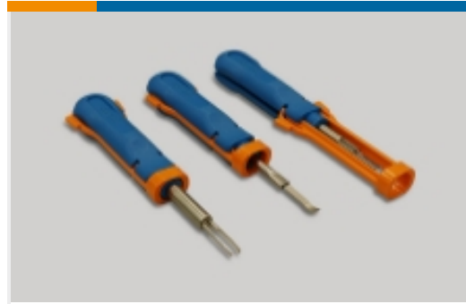
Insertion & Extraction Tools(13)