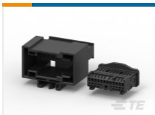
TE Part #1719059-1 MQS, CONNECTOR HOUSING