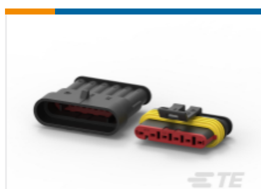
TE Part #282104-1 AMP SUPERSEAL 1.5MM, CONNECTOR HOUSING