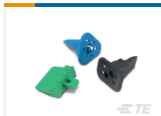
TE Part #W2S DEUTSCH DT WEDGELOCKS