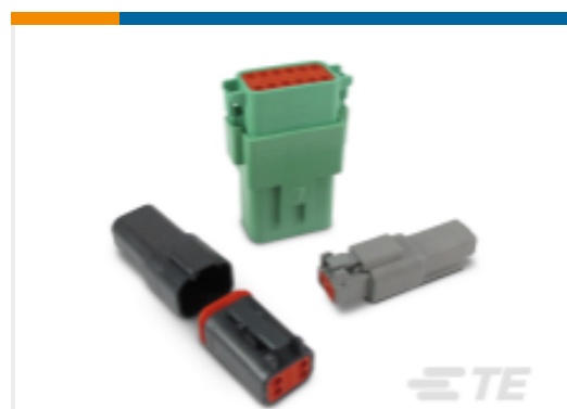
TE Part #DT06-2S DEUTSCH DT Series Housings & Connectors