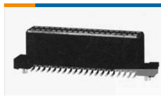
TE Part # 147378-5 50 SYS50 SMT RCP DR SHD W/O HD