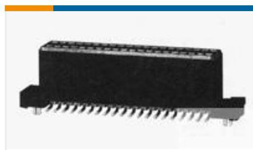
TE Part # 104550-6 50 SYS50 SURFMNT DRST RCPT