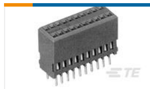
TE Part # 104744-7 50 SYSTEM 50 RCPT ASSY DRST