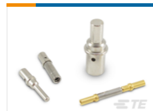
TE Part #0460-202-16141 DEUTSCH SOLID CONTACTS