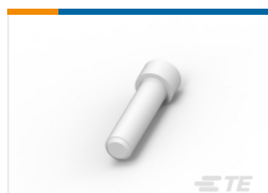
TE Part #114017-ZZ SEALING PLUG, SIZE 12/16, WHT