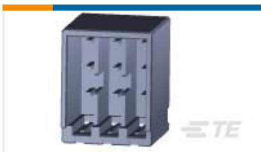
TE Part #1-1827581-3 DYNAMIC 1500T HDR ASSY V 9P X BLACK GOLD