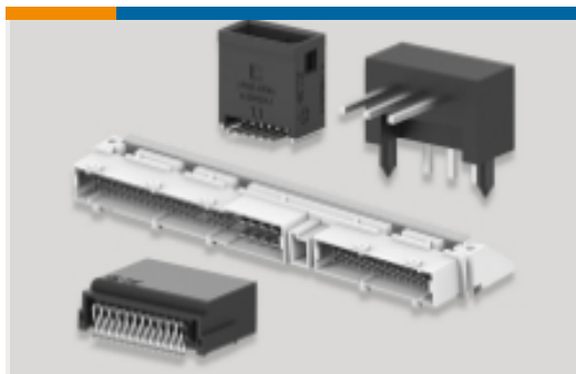
PCB Headers &amp; Receptacles(13)