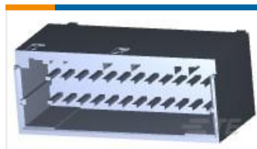
TE Part #1-1827872-3 DYNAMIC 1100D HDR ASSY V 26P XBLACK GOLD