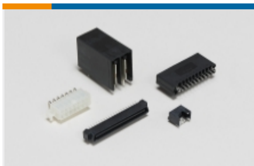
Standard Rectangular Connectors(32)