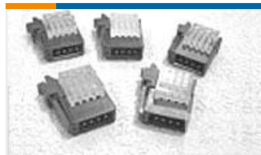
TE Part #2-1473562-3 RITS CONN. PLUG ASSY 3P BLUE