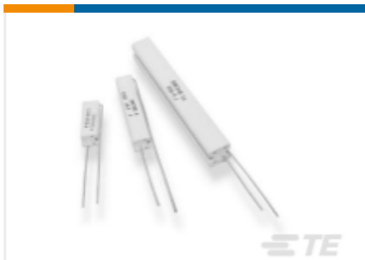
TE Part #1623730-1 Wirewound Resistor: Vertical Mount