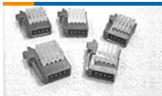
TE Part #1473562-8 RITS CONN. PLUG ASSY 8P YELLOW