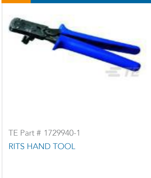
TE Part # 1729940-1 RITS HAND TOOL