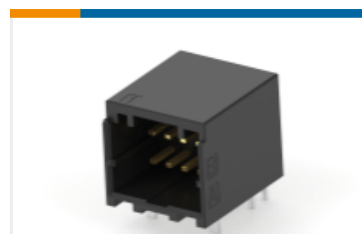
TE Part #1-1827872-3 Header Assembly: Wire-to-Board, 3A, gold or Tin plated