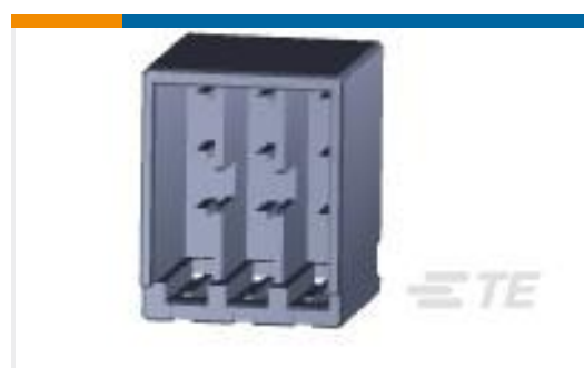
TE Part #1-1827581-3 DYNAMIC 1500T HDR ASSY V 9P X BLACK GOLD