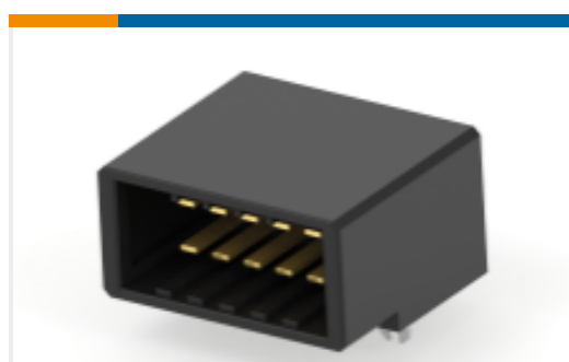
TE Part #1-178315-2 Header Assembly: Wire-to-Board, 15A, gold or tin plated