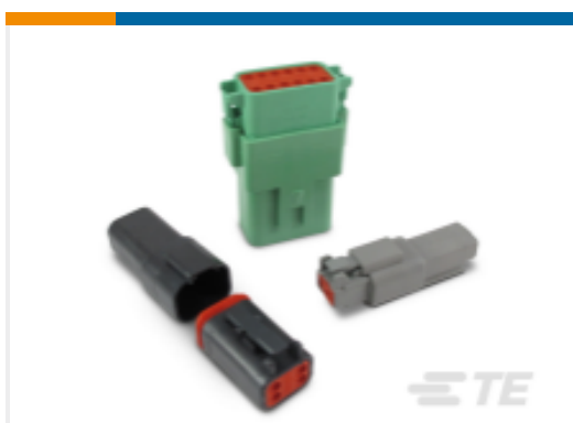
TE Part #DT06-2S DEUTSCH DT Series Housings & Connectors