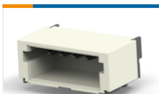
TE Part #1-1734595-3 AMP HPI 1.0MM HEADERS