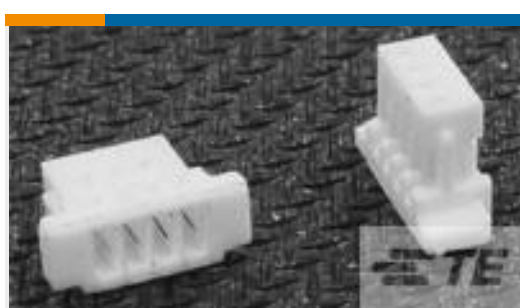
TE Part #1-1470364-0 1.0MM W T B RECPT,10POSHOUSING