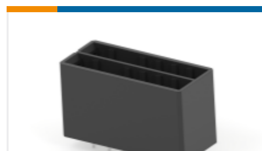
TE Part #1-917338-3 Header Assembly: Wire-to-Board, 15A, gold or tin plated