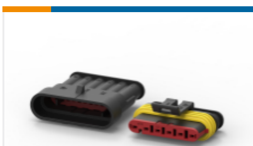
TE Part #282104-1 AMP SUPERSEAL 1.5MM, CONNECTOR HOUSING