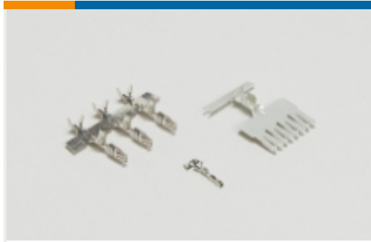
Busbars & Terminals(1)