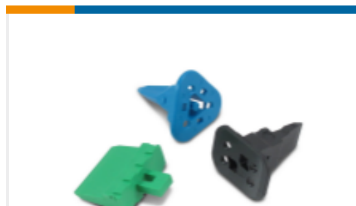
TE Part #W2S DEUTSCH DT WEDGELOCKS