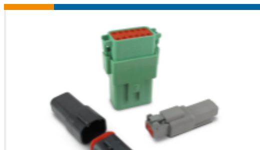
TE Part #DT04-2P DEUTSCH DT Series Housings & Connectors