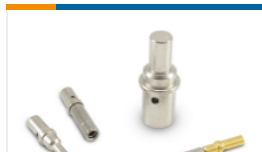
TE Part #0460-202-16141 DEUTSCH SOLID CONTACTS