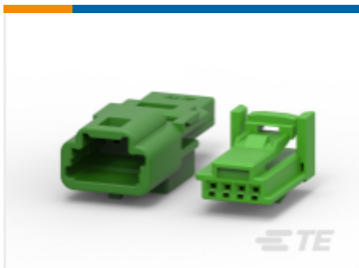
TE Part #1376103-1 TH/.025 CONNECTOR SYSTEM, HOUSING