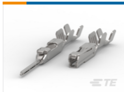
TE Part #1376109-1 TH/.025 CONNECTOR SYSTEM, RECPT AND TAB