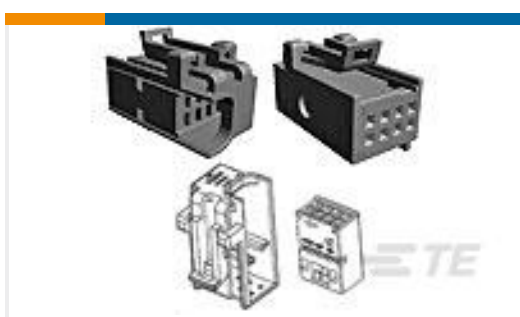
TE Part #1745000-4 8POS MQS REC