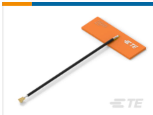
TE Part #2344654-5 WLAN DUAL BAND ANTENNA PCB V 50 MHF4 TYP