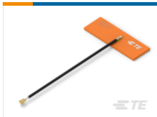
TE Part #2344654-6 WLAN DUAL BAND ANTENNA PCB V 100 MHF4 TY