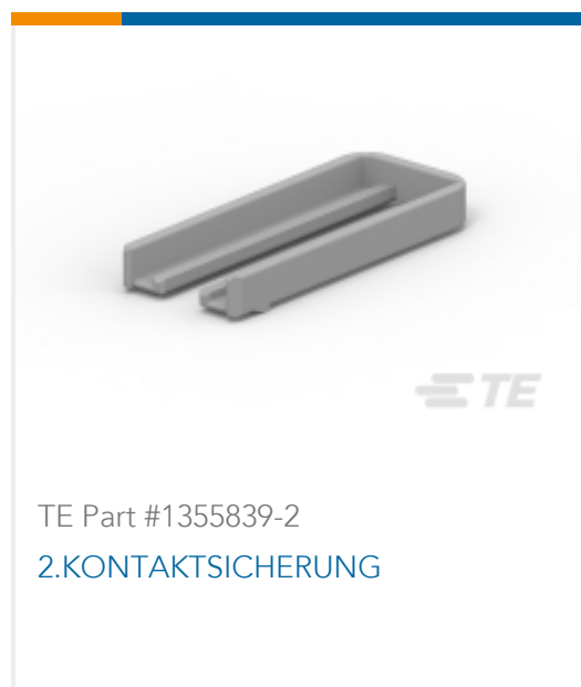
TE Part #1355839-2 2.KONTAKTSICHERUNG