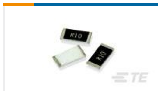
TE Part #4-2176056-8 RLP73K 2B R91 5% 5K RL