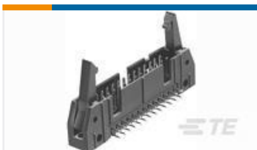
TE Part #5499141-2 A/L UNIV HDR 14P RA LG LAT