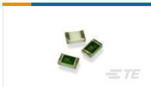
TE Part #5-1879061-1 CPF 0402 1K0 0.1% 25PPM 5K RL