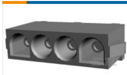
TE Part #350826-4 04P UMNL HDR ASSY PC 94VO LF