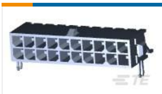
TE Part #5-794626-0 20P MICRO MNL ASSY,R/A,SMT,LF