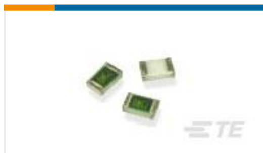
TE Part #5-1614352-1 RN 0603 2K0 0.1% 10PPM CUT LENGTH