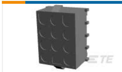
TE Part #350829-4 12P UMNL HDR ASSY PC 94VO LF