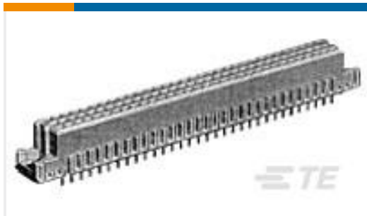
TE Part #5535097-5 ASSEMBLY,RECEPTACLE,EUROCARD, T