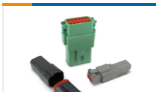
TE Part #DT04-2P DEUTSCH DT Series Housings & Connectors