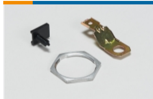
Other Automotive Connector Accessories(13)