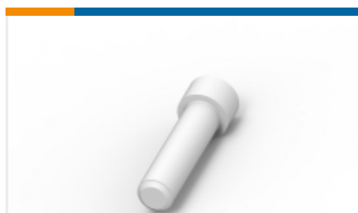
TE Part #114017-ZZ SEALING PLUG, SIZE 12/16, WHT