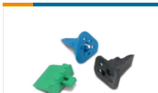
TE Part #W2S DEUTSCH DT WEDGELOCKS