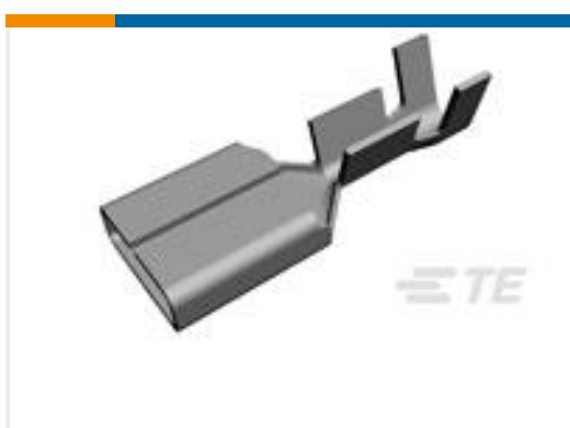
TE Part #1544275-2 CLIP 6,3 SECU 1-3