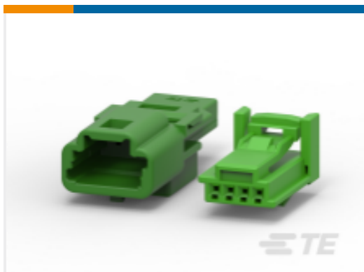
TE Part #1379659-5 TH/.025 CONNECTOR SYSTEM, HOUSING