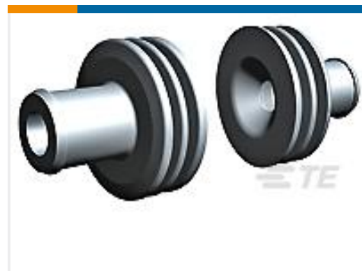
TE Part #1544316-1 JOINT VERT G2