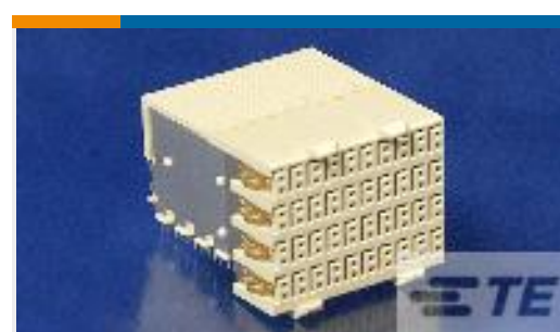
TE Part #2065657-1 zd Plus, 4 pair, receptacle assy