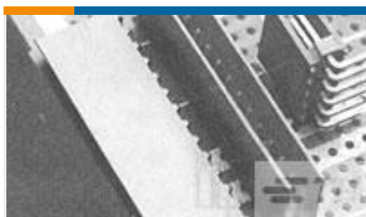
TE Part #281698-5 HEADER HE14 RA 5 P