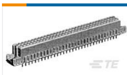
TE Part #5535043-4 ASSY,RECEPTACLE,EUROCARD,TYPE