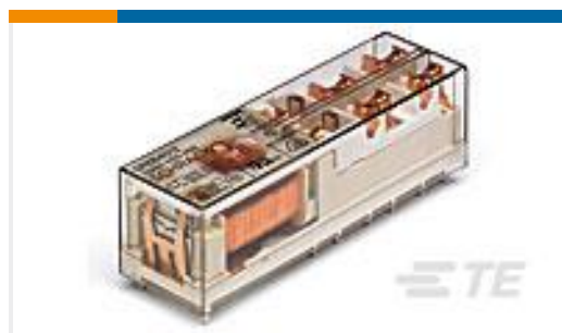
TE Part #6-1415537-5 SR6A6K24