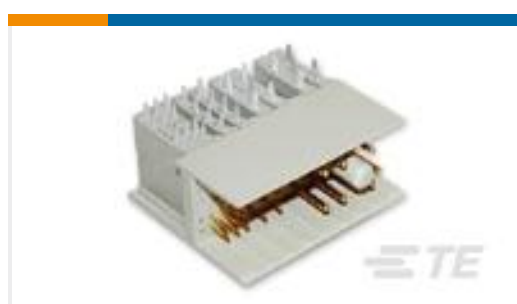
TE Part #1766500-1 Assembly, Right Angle, Advance