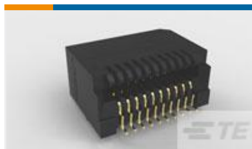
TE Part #1888247-2 20 POS SMT CONN, SFP/SFP+, 15A