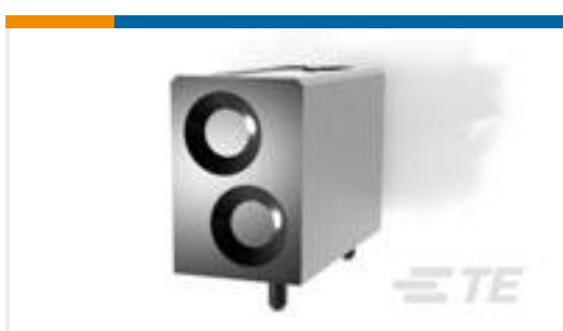
TE Part #1469374-1 ATCA GUIDE RIGHT ANGLE FEMALE