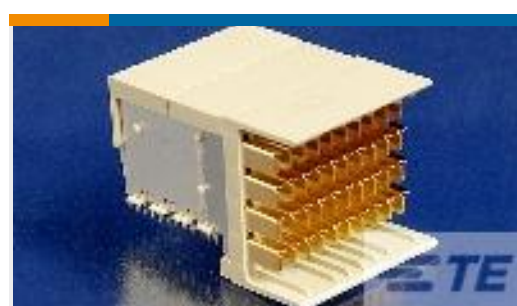
TE Part #6469048-1 HMZD 4PR RA HDR 80P ASSY LF