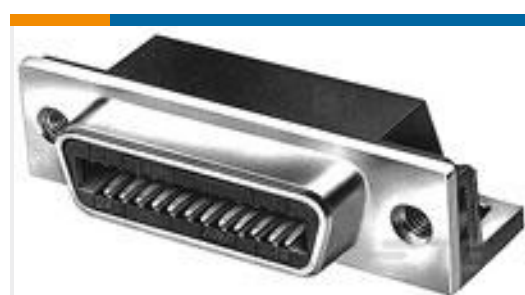
TE Part #5553813-3 ASSY,EMI RCPT,50 POSN,SCR LK