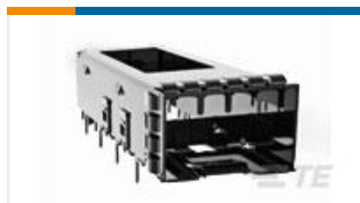
TE Part #2007198-2 SFP+ 1x1 Cage Assembly, Press-Fit