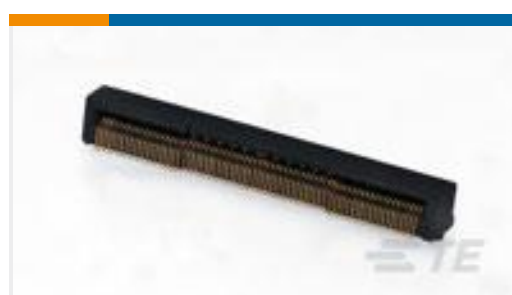
TE Part #2057630-1 CFP Receptacle Conn Assy