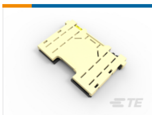
TE Part #2-2129710-6 RIGHT SIDE LGA3647-0 SOCKET-P0 FOR ODM