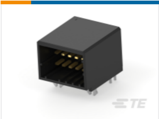
TE Part #1376020-2 Header Assembly: Wire-to-Board, 5A, gold plated