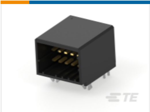
TE Part #1318124-1 Header Assembly: Wire-to-Board, 5A, gold plated