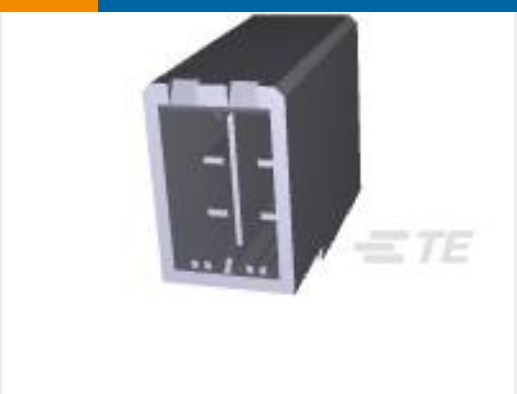
TE Part #1376133-2 DYNAMIC D-3500 HDR ASSY 4P