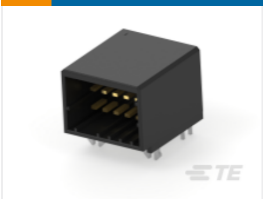
TE Part #1376137-2 Header Assembly: Wire-to-Board, 5A, gold plated