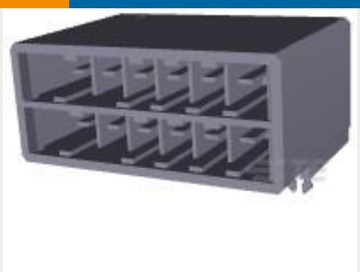
TE Part #1-316081-2 DYNAMIC D-3200 HDR ASSY 12P H