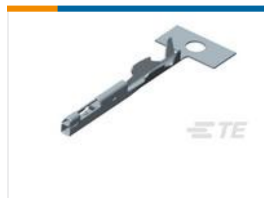
TE Part #2177909-1 MCON 0.50 TERMINAL