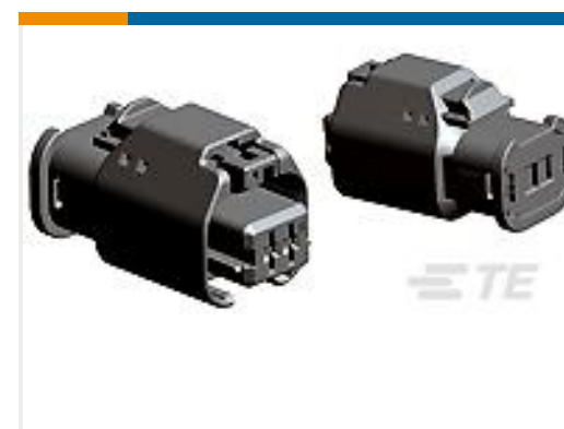
TE Part #1801175-1 2W RECEPTACLE HP CONNECTOR BLACK