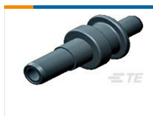
TE Part #2138982-1 JACK SUBASSEMBLY, 1.5DS-QFB, FAKRA