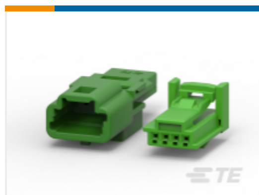
TE Part #1379675-1 TH/.025 CONNECTOR SYSTEM, HOUSING