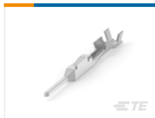
TE Part #1802190-1 TAB0.64X0.64,TERMINAL