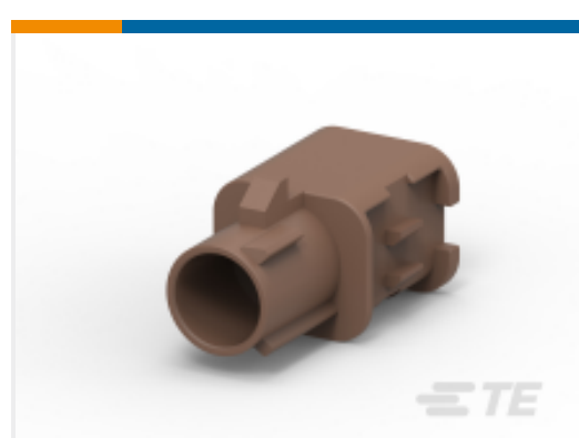
TE Part #1438887-6 JACK HOUSING, 1 POSITION, 180 DEGREE, FA