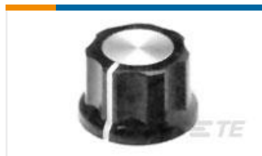
TE Part #5-1437624-2 PKES70B1/4=KNOB FLUTED W/SKIRT