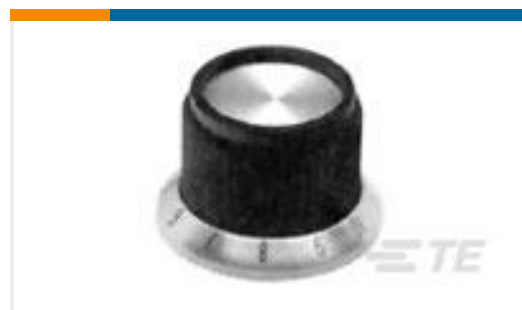
TE Part #3-1437624-2 PKD70B101/4=KNOB PLASTIC W/SKI