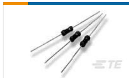
TE Part #1625893-4 5W SM M/OX 5% 22R