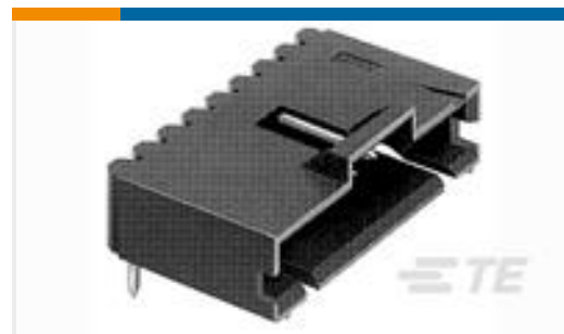
TE Part #103635-1 02 MTE HDR SRRA LATCH .100CL