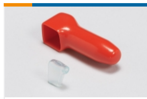
Insulation Boots &amp; Sleeves(7)