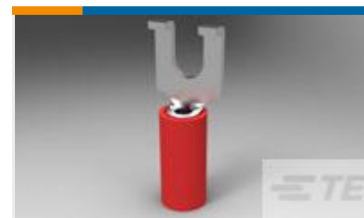
TE Part #2-32562-1 PIDG SPDFLG 22-16COMM22-18MIL6