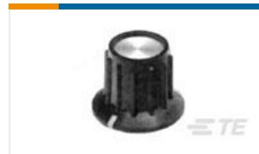
TE Part #1-1437624-0 PKA50B1/4=KNOB PLASTIC 1/4" SH