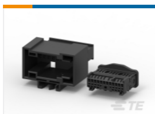
TE Part #1241634-3 MQS, CONNECTOR HOUSING