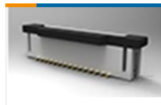
TE Part #2-1734248-4 1.0 FPC, ZIF V/T, SMT, 24P