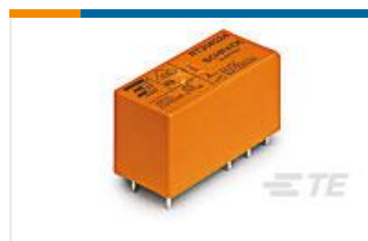
TE Part #4-1393240-5 RT334012