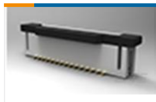
TE Part #1-1734248-0 1.0 FPC, ZIF V/T, SMT, 10P