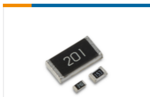
TE Part #3-2176330-9 CRGP 2010 15K 1%