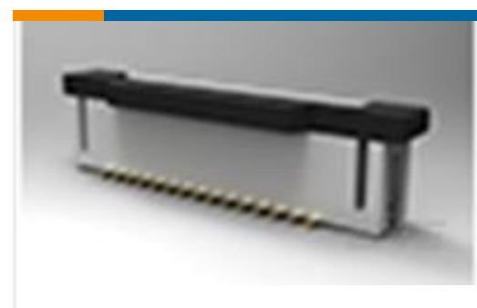
TE Part #3-1734248-0 1.0 FPC, ZIF V/T, SMT, 30P