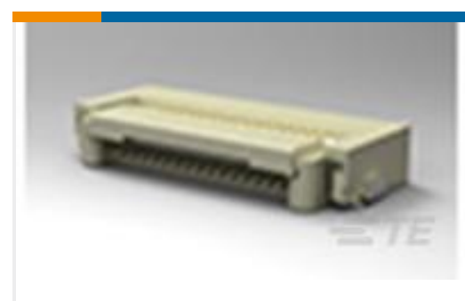
TE Part #5-1775333-0 ZIF FPC 0.5, 2H, 50P