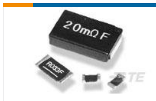
TE Part #4-1879378-2 TLR 2512 2.0W R006 1% 75PPM 2K RL