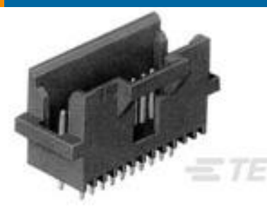
TE Part # 1-104666-1 26 SYSTEM 50 HDR DRST SHRD