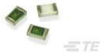
TE Part #1-1676153-2 RN 0805 10K 0.01% 10PPM 1K RL