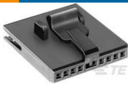
TE Part #1-487545-0 013 HOUSING FFC RCPT 050CL SR