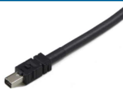
TE Part #2-2205130-2 CA MINI IO TYPE II PIGTAIL