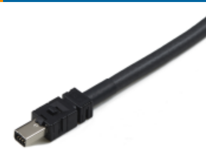
TE Part #2-2205130-4 CA MINI IO TYPE II PIGTAIL