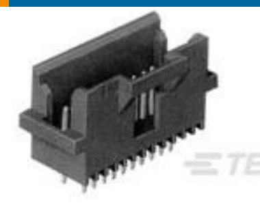
TE Part # 104864-5 26 SYSTEM 50 HDR DRST SHRD