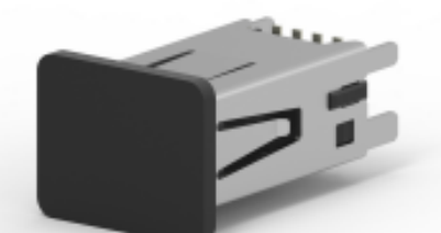
TE Part #1-2271656-2 MINI IO VERTICAL SMT PLUS REC CONN KIT