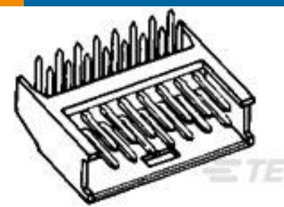
TE Part #281021-2 2X18P MODU II SHRD HDR, RT ANG, AU