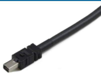
TE Part #2-2205130-1 CA MINI IO TYPE II PIGTAIL