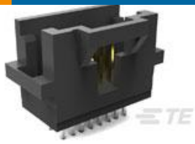
TE Part # 1-104068-2 26 SYSTEM 50 HDR DRST SHRD