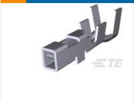
TE Part #1827572-2 DYNAMIC D1000 REC CONT 2L AU 0.38um FORM