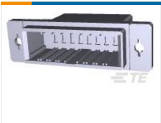
TE Part #178803-7 DYNAMIC D3100D TAB HSG PM 16P