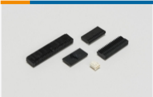
Wire-to-Board Connector Assemblies & Housings(71)