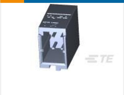
TE Part #1-1827876-2 DYNAMIC 1200D HDR ASSY H 4P X BLACK GOLD