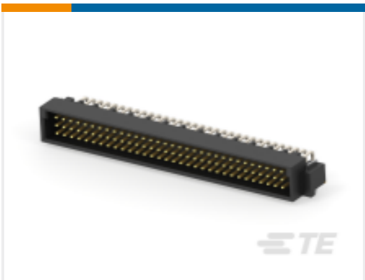
TE Part #4-2271099-0 CELLO,MALE,RA, 2.54PITCH, DIP3.0, WC