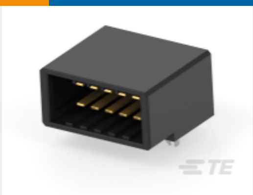
TE Part #178323-2 Header Assembly: Wire-to-Board, 15A, gold or tin plated