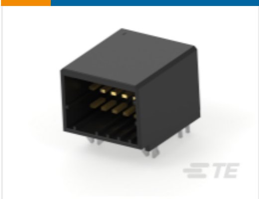
TE Part #1318124-1 Header Assembly: Wire-to-Board, 5A, gold plated