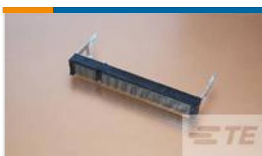
TE Part #1981284-4 SEMI-HARD TRAY DDR2 SODIMM 9.2 H STD AMC