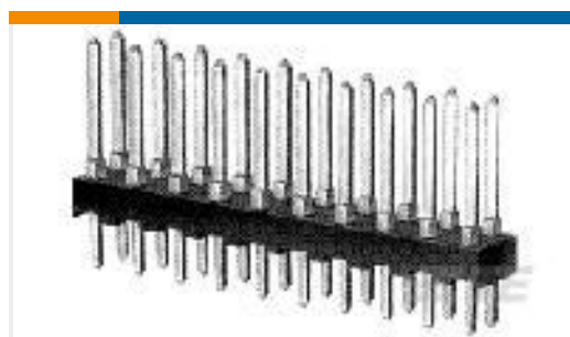
TE Part #87227-2 04 MODII HDR DRST UNSHRD .100