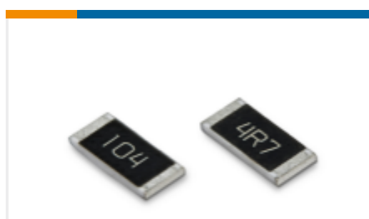
TE Part #2-1879207-1 RN 0603 324K 0.1% 10PPM 5K RL