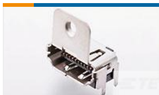
TE Part #2-1747981-3 Std HDMI, RA, SMT, Panel grd, Flange