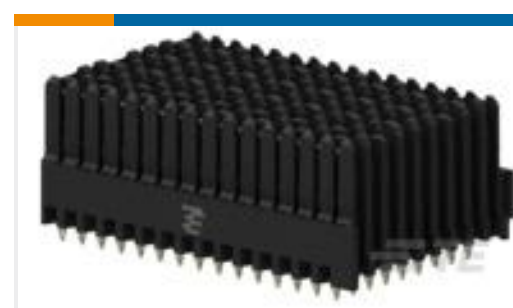
TE Part #2102768-1 BP, Center, RTM, MULTIGIG RT 2R