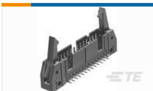
TE Part #5499786-5 A/L UNIV HDR 24P RA LG LAT