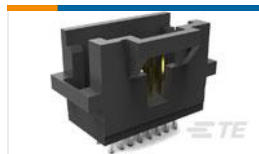
TE Part #104068-5 50 SYSTEM 50 HDR DRST SHRD