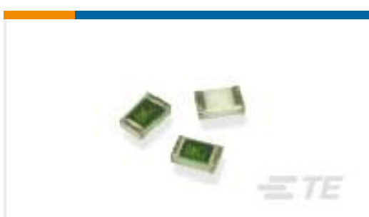
TE Part #6-2176088-3 RP 1J 0.166W 3K92 0.1% 25PPM 1K RL