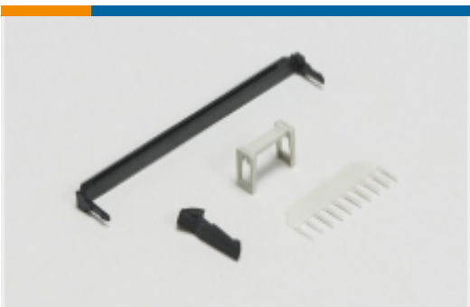
Ribbon Connector Accessories(1)