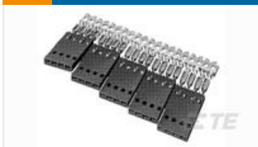
TE Part # 103648-5 06 MTE RCPT HSG SR RIB .100CL