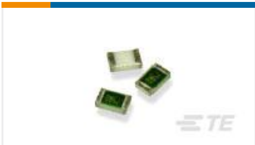
TE Part #9-1879213-6 CPF 0402 294R 0.1% 25PPM 1K RL