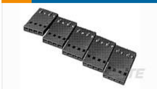
TE Part # 104503-5 06 MTE PIN HSG SR RIB .100CL