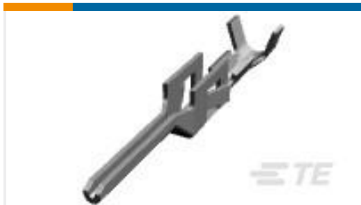
TE Part #1-794613-1 PIN CONT 26-30 15 GOLD L/P