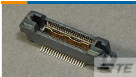
TE Part #5767007-8 MICT,260PLUG,38,ASSY,.025,REC