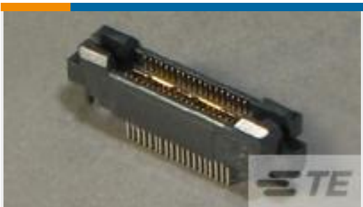
TE Part #5767055-1 MICT,R/APLUG,ASSY,38,PDNI