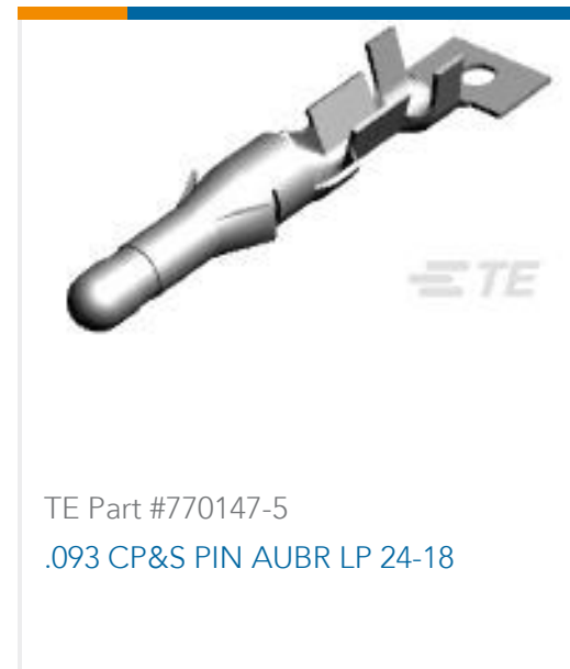
TE Part #770147-5 .093 CP&S PIN AUBR LP 24-18