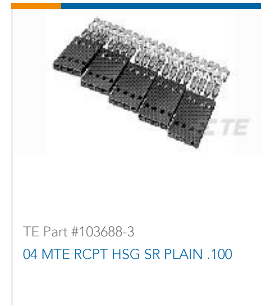
TE Part #103688-3 04 MTE RCPT HSG SR PLAIN .100