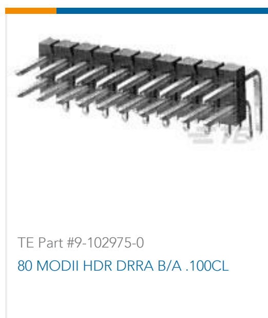
TE Part #9-102975-0 80 MODII HDR DRRA B/A .100CL