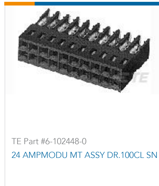
TE Part #6-102448-0 24 AMPMODU MT ASSY DR.100CL SN