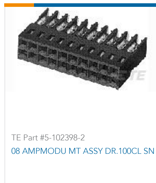
TE Part #5-102398-2 08 AMPMODU MT ASSY DR.100CL SN