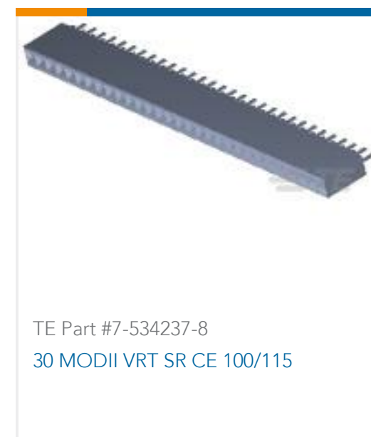
TE Part #7-534237-8 30 MODII VRT SR CE 100/115