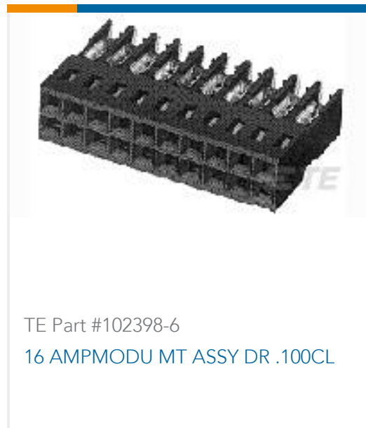
TE Part #102398-6 16 AMPMODU MT ASSY DR .100CL