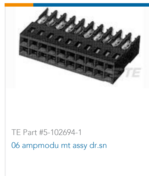
TE Part #5-102694-1 06 ampmodu mt assy dr.sn