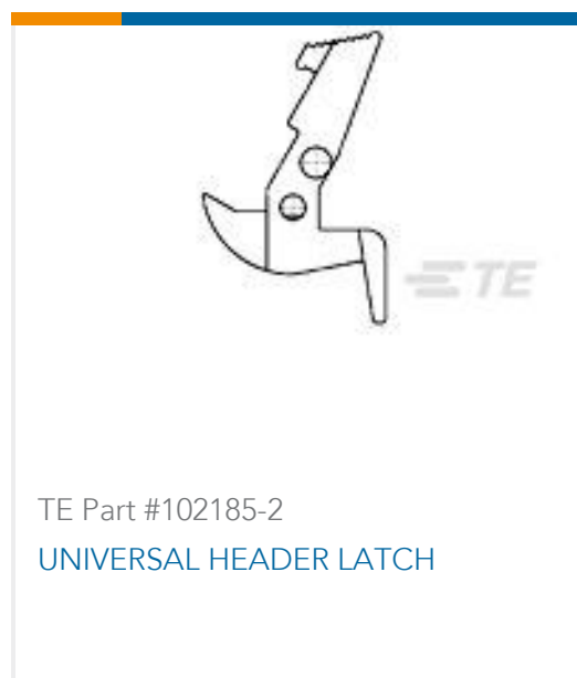
TE Part #102185-2 UNIVERSAL HEADER LATCH