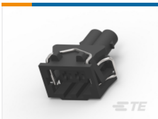
TE Part #1418893-1 2POS.JPT HSG. ASSY