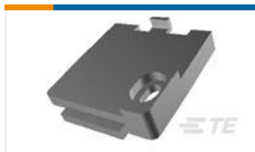
TE Part #641775-1 04P UMNL STR/REL & INSRT NATL