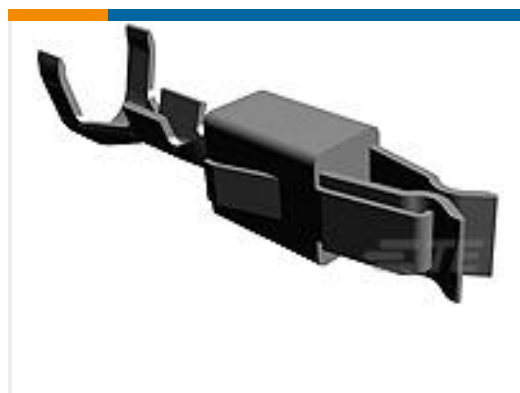
TE Part #964282-2 JPT A REC 2.8 Contact SWS Sn