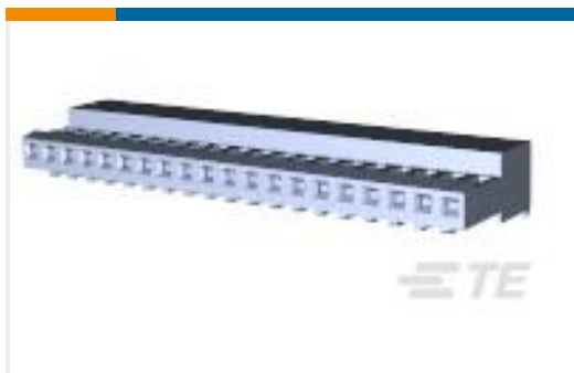
TE Part #5-640440-0 20P MTA100 CONN ASSY 22AWG RED