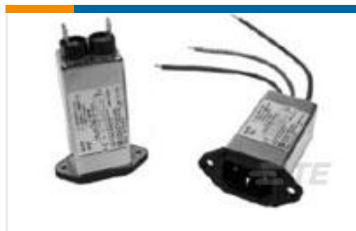
TE Part #2-6609006-4 10EJT1=F8136