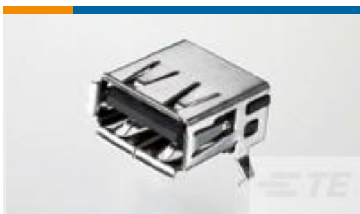
TE Part #292303-6 Std USB Type A, R/A, T/H