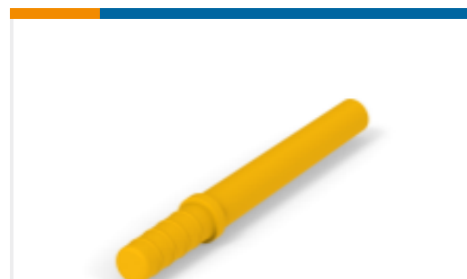
TE Part #0413-214-1205 SEALING PLUG, SIZE 12, KEYING, YEL