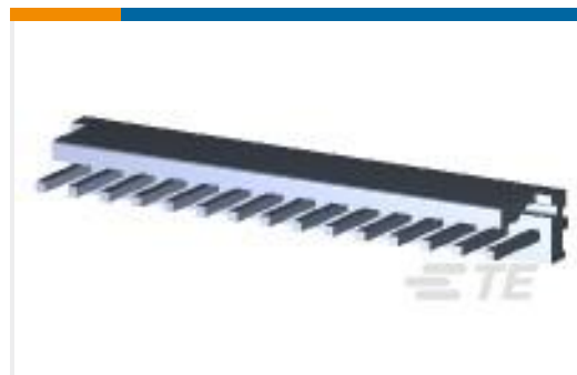
TE Part #1-640445-5 15P MTA156 HDR ASSY FL/STR SNL