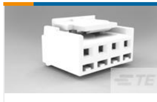
TE Part #1744416-7 7 POS EP II HSG, GLOW WIRE