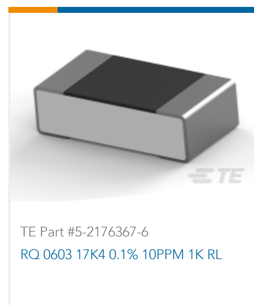
TE Part #5-2176367-6 RQ 0603 17K4 0.1% 10PPM 1K RL