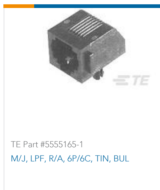
TE Part #5555165-1 M/J, LPF, R/A, 6P/6C, TIN, BUL