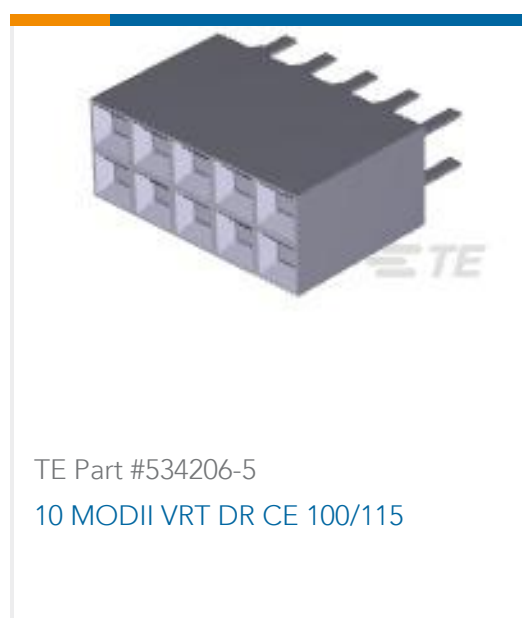
TE Part #534206-5 10 MODII VRT DR CE 100/115