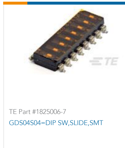
TE Part #1825006-7 GDS04S04=DIP SW,SLIDE,SMT