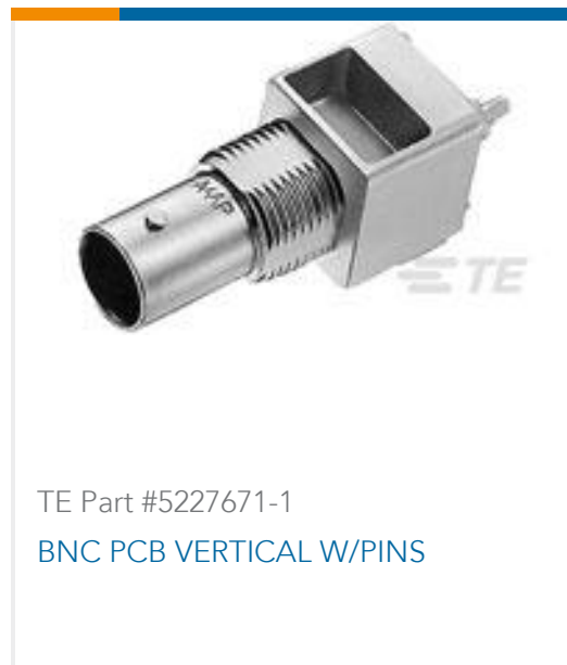
TE Part #5227671-1 BNC PCB VERTICAL W/PINS