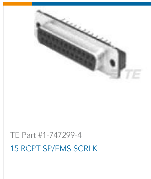
TE Part #1-747299-4 15 RCPT SP/FMS SCRLK