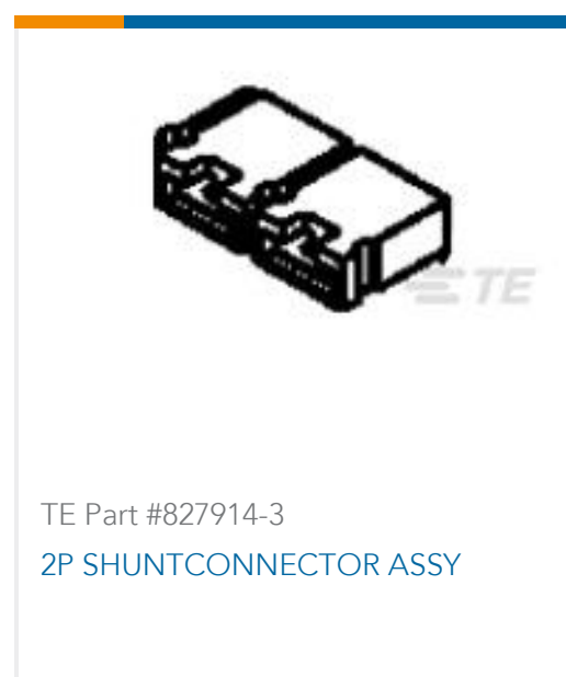
TE Part #827914-3 2P SHUNTCONNECTOR ASSY