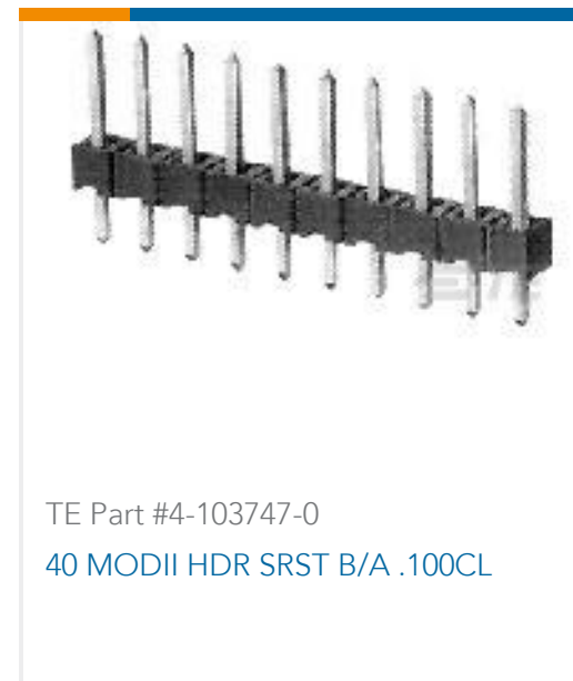
TE Part #4-103747-0 40 MODII HDR SRST B/A .100CL