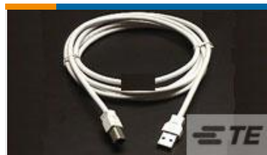
TE Part #1487593-2 USB, A-BLUNT,28/24,WHT,1.5M