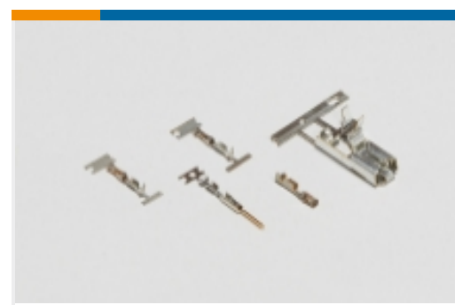
Wire-to-Board Connector Contacts(32)