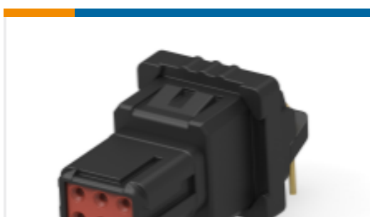
TE Part #YD369-B99-AP400000 Rectangular Connectors, 9 Way Panel Mount