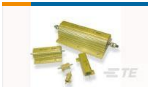
TE Part #1-1630019-4 HSC200 2K4 5%