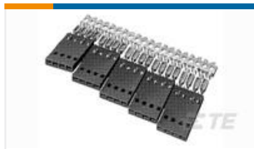
TE Part # 103970-3 5X4 MTE RCPT SR RIBBED .100CL