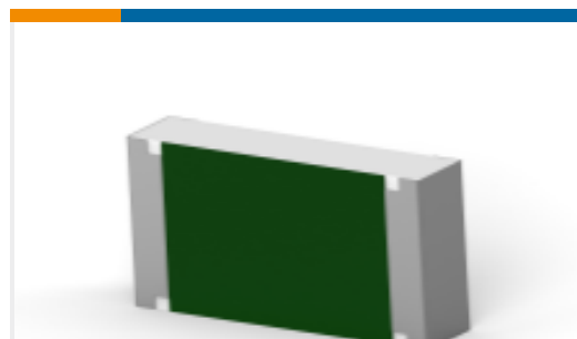
TE Part #9-2176397-4 3502 7K5 1%