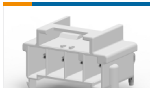
TE Part #1-1969694-4 PTL 1X4 PCB HEADER R/A HITEMP KEY A LGR