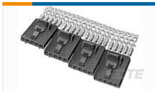
TE Part # 103961-3 5X4 MTE RCPT SR LATHC .100CL