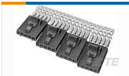
TE Part # 103958-3 5X4 MTE RCPT SR LATCH .100CL